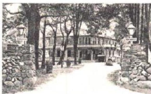
“The Oakwood”, Green Lake Wisconsin Birthday Place of the Ancient and Honorable Order of The Blue Goose

Blue Goose has an annual Grand Nest Meeting of delegates, which is a Summer convention held at various locations throughout the USA and Canada, where its members ( Ganders ) and their families meet for fun and fellowship. There is usually a large class of new members ( Goslings ) initiated at that meeting. The Cardinal Principles of the order are Character, Charity and Fellowship . There's a secret key honk (password) and a secret salutation that have existed since the flight of the first Blue Goose on June 19, 1906.