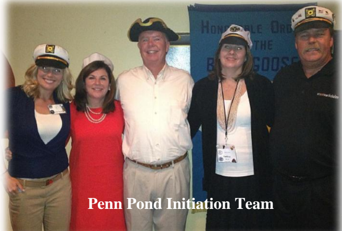
Penn Pond Initiation Team