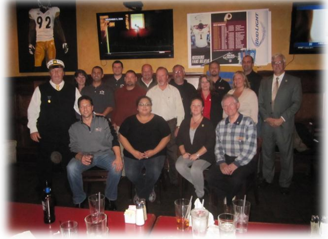
Nova Puddle Charter Members